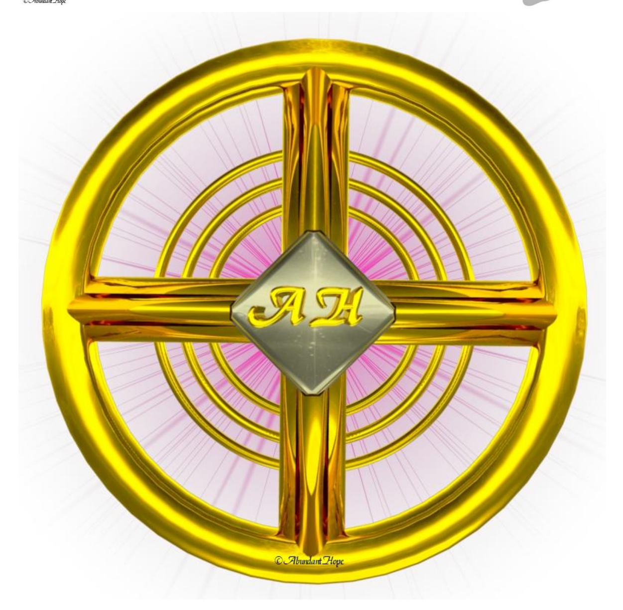
Rosie's Meditations # 2