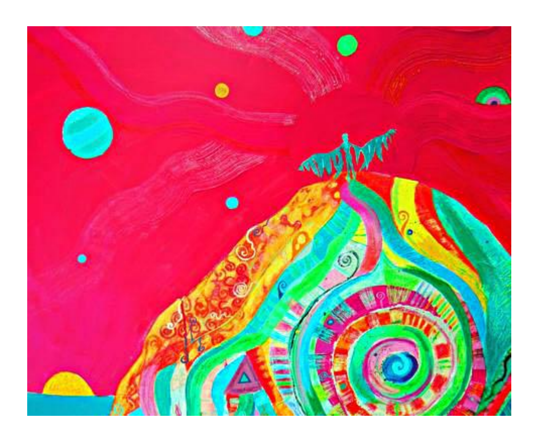
Meditation Report 121, 16th October 2012 THE INITIATION RITUAL

At the beginning of this meditation I asked for those children to appear in front of me who required healing. One baby needed gently tapping on the back, and one toddler had a skin ailment and was very frightened of meeting a stranger. I sensed that he had been chased and hit by a man in the past, and so I approached him very slowly and playfully. In the end I told him that his spiritual father was always surrounding him like a soft white eggshell, and that he would always be present and comforting, but would never be purposely hurtful or impose or overstep any boundaries.